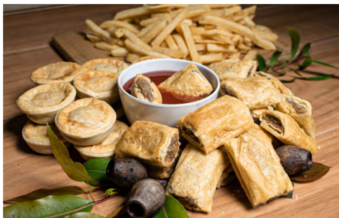
PIES, SAUSAGE ROLLS & CHIPS