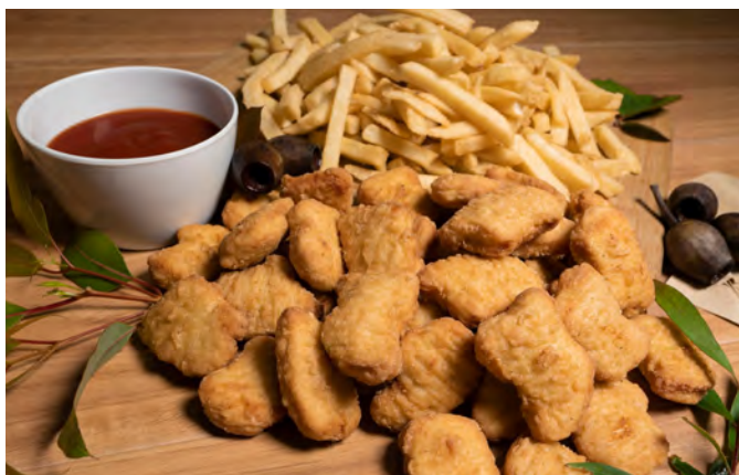
NUGGETS & CHIPS