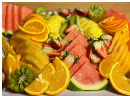
SEASONAL FRUIT (LARGE PLATTER)